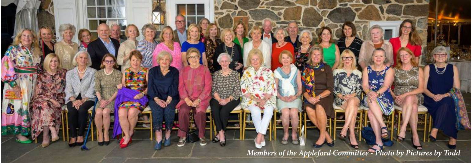
Members of the Appleford Committee