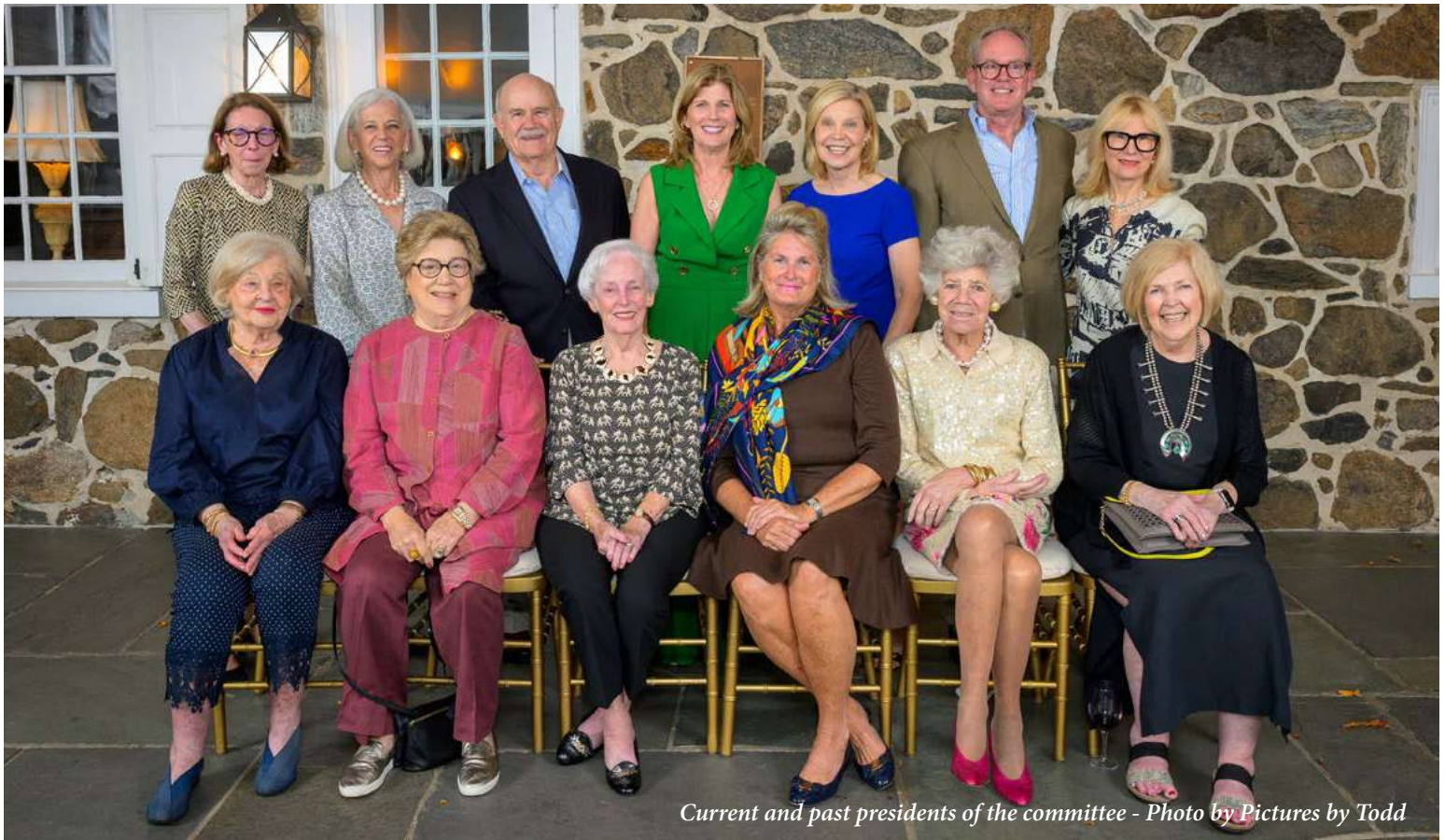
Current and past presidents of the committee