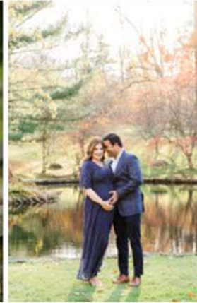
Konnor & Samantha Photography